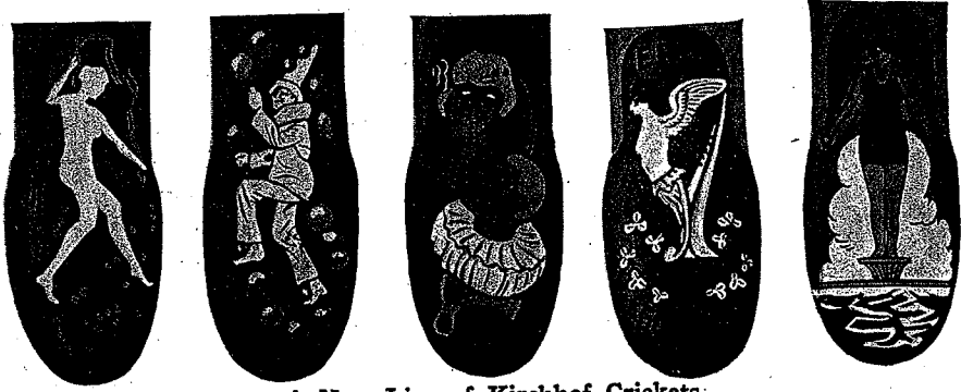
A New Line of Kirchof Crickets.

The Kirchof Patent Company of Newark, N. J. have just brought out a new line of St. Patrick's Day and Dance and Carnival Crickets, a few of which are illustrated herewith. The Carnival Crickets are finished in seven attractive lithographed designs and are suitable for Dances, Carnivals, Amusements Parks, Seashore, Banquets, etc. The designs range from Ballroom to Seashore scenes. The St. Patrick's Crickets come in four attractive lithographed designs. All of these are packed one gross to the box in assorted designs and in shipping packages of twenty-five and fifty gross. Although just brought out these items are proving ready sellers. Despite the volume of orders on hand this concern is in a position to make immediate delivery.